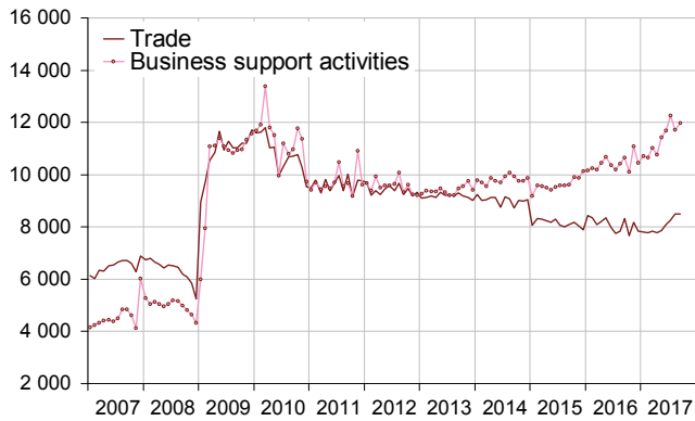
Trade and business support activities start-ups (SA-WDA *)

* Seasonally and working-day adjusted data