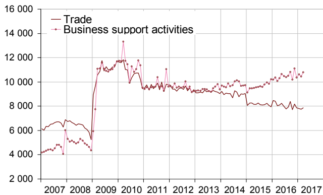
Trade and business support activities start-ups (sa-wda *)

* Seasonally and working-day adjusted data