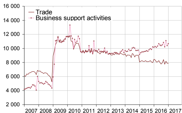
Trade and business support activities start-ups (sa-wda *)

* Seasonally and working-day adjusted data