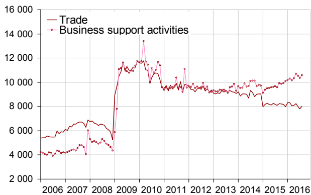
Trade and business support activities start-ups (sa-wda *)

* Seasonally and working-day adjusted data