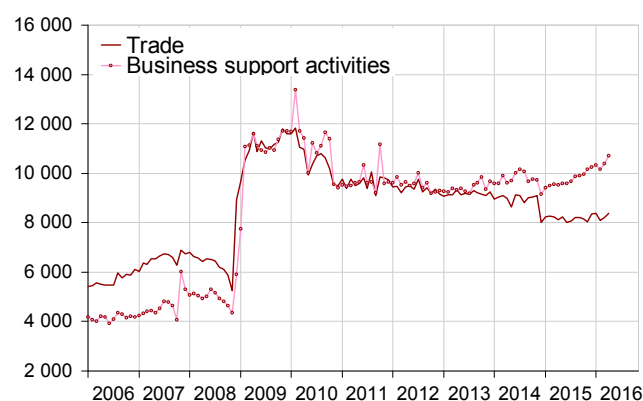
Trade and business support activities start-ups (sa-wda *)