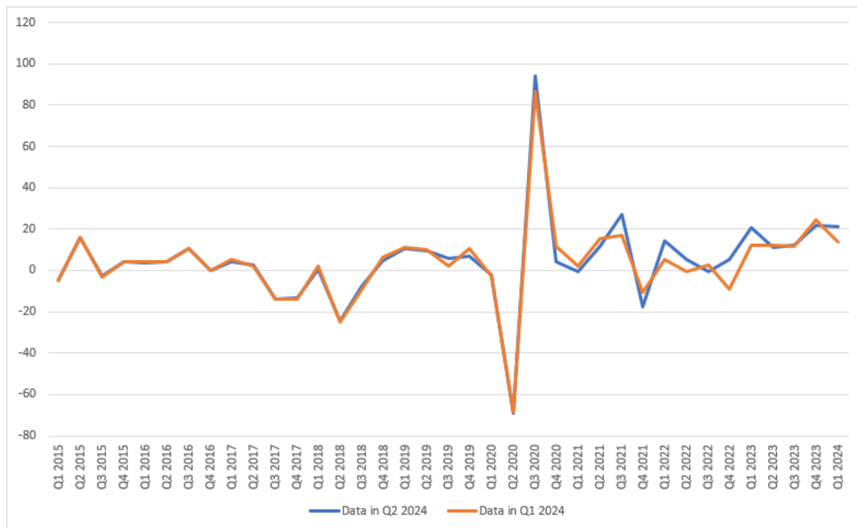
Figure 4. Evolution of public payroll employment in quarters (in thousands)