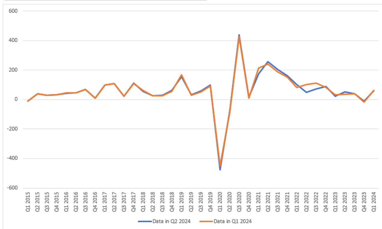
Figure 3. Evolution of private payroll employment in quarters (in thousands)