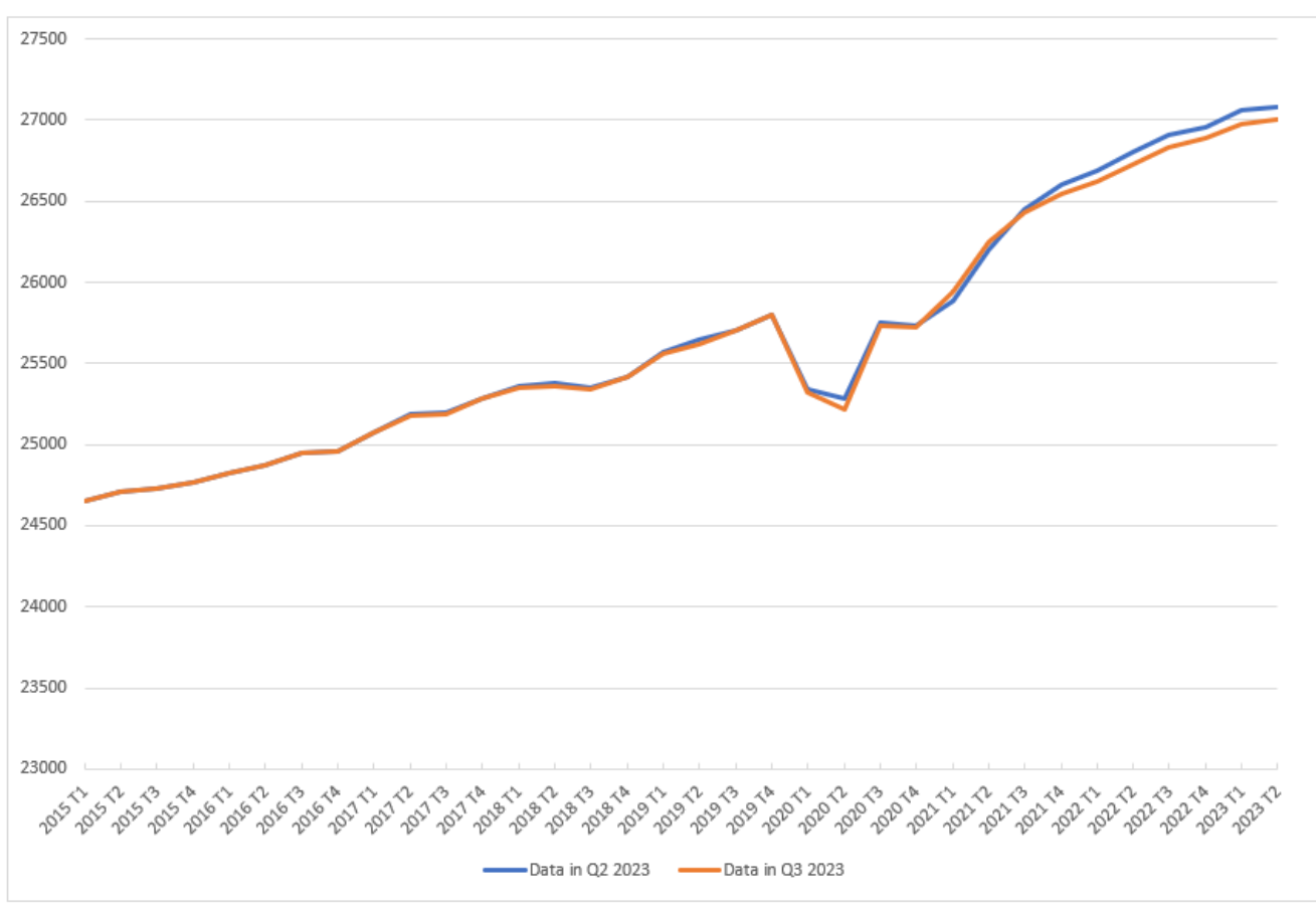
Figure 1. Levels of total payroll employment in quarters (in thousands)

levels were revised downwards since the end of 2021 ( figure 1 ). The infra-annual profile of trends in total and private employment estimates has been revised, especially in 2021 ( figure 2 and 3 ).